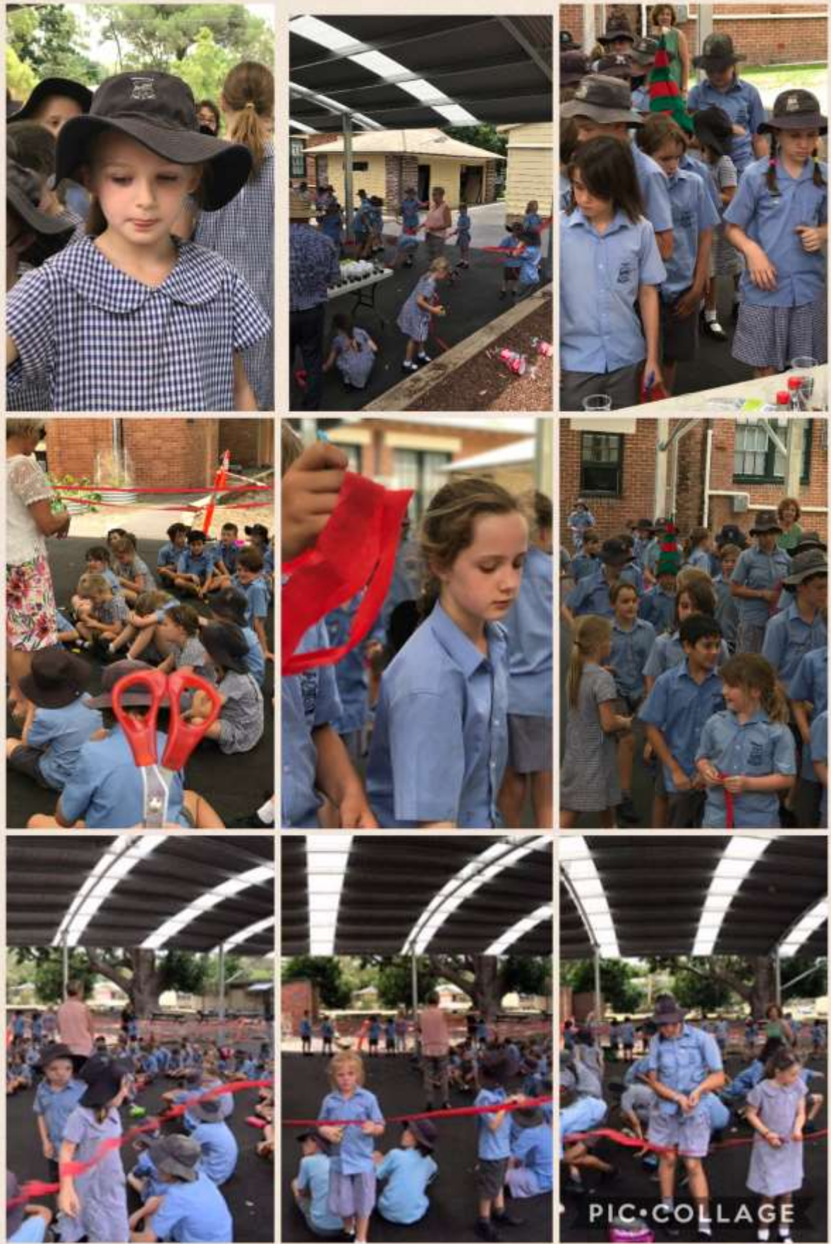
Official opening of Brooklyn Public School COLA December 2016