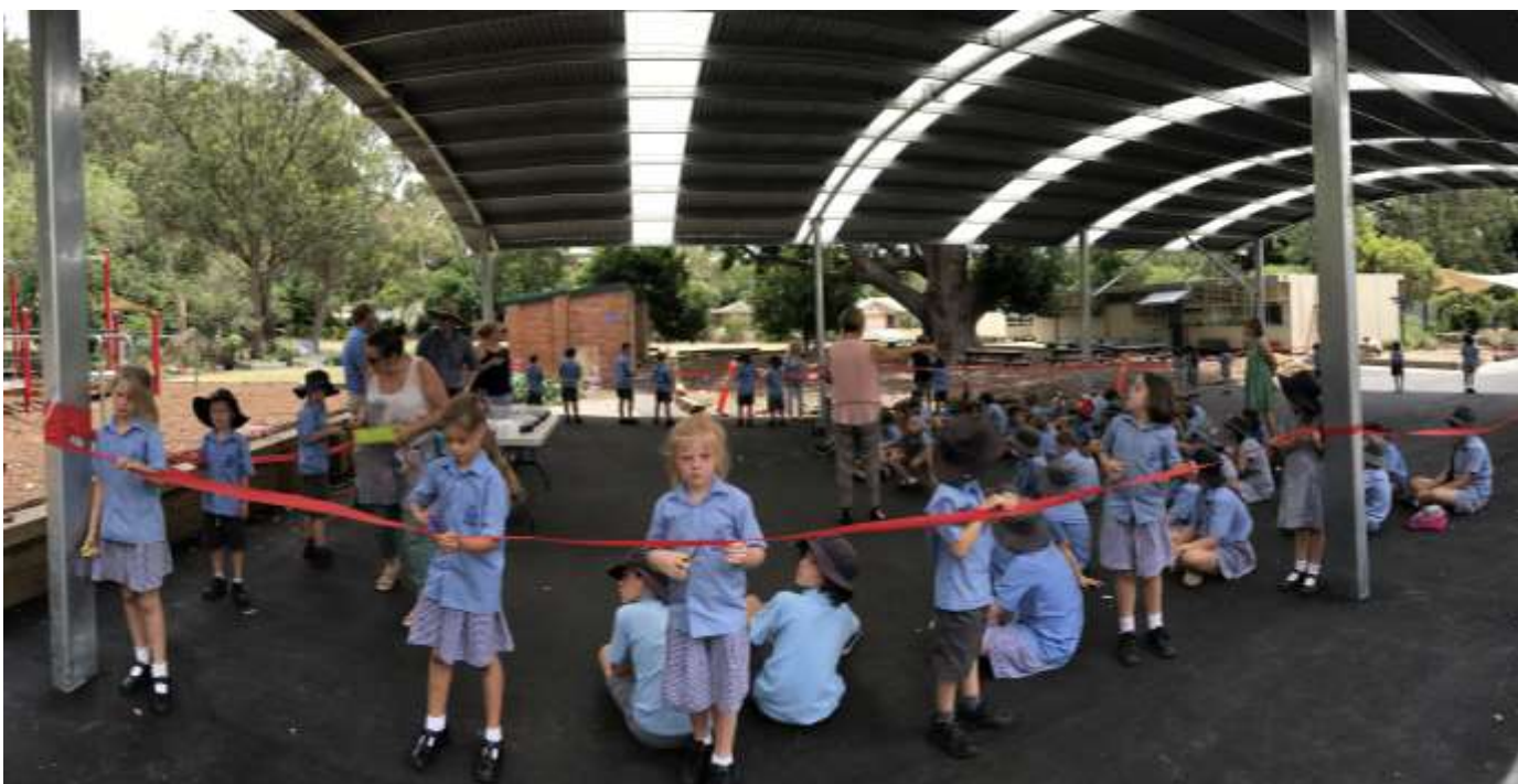
Official opening of Brooklyn Public School COLA December 2016