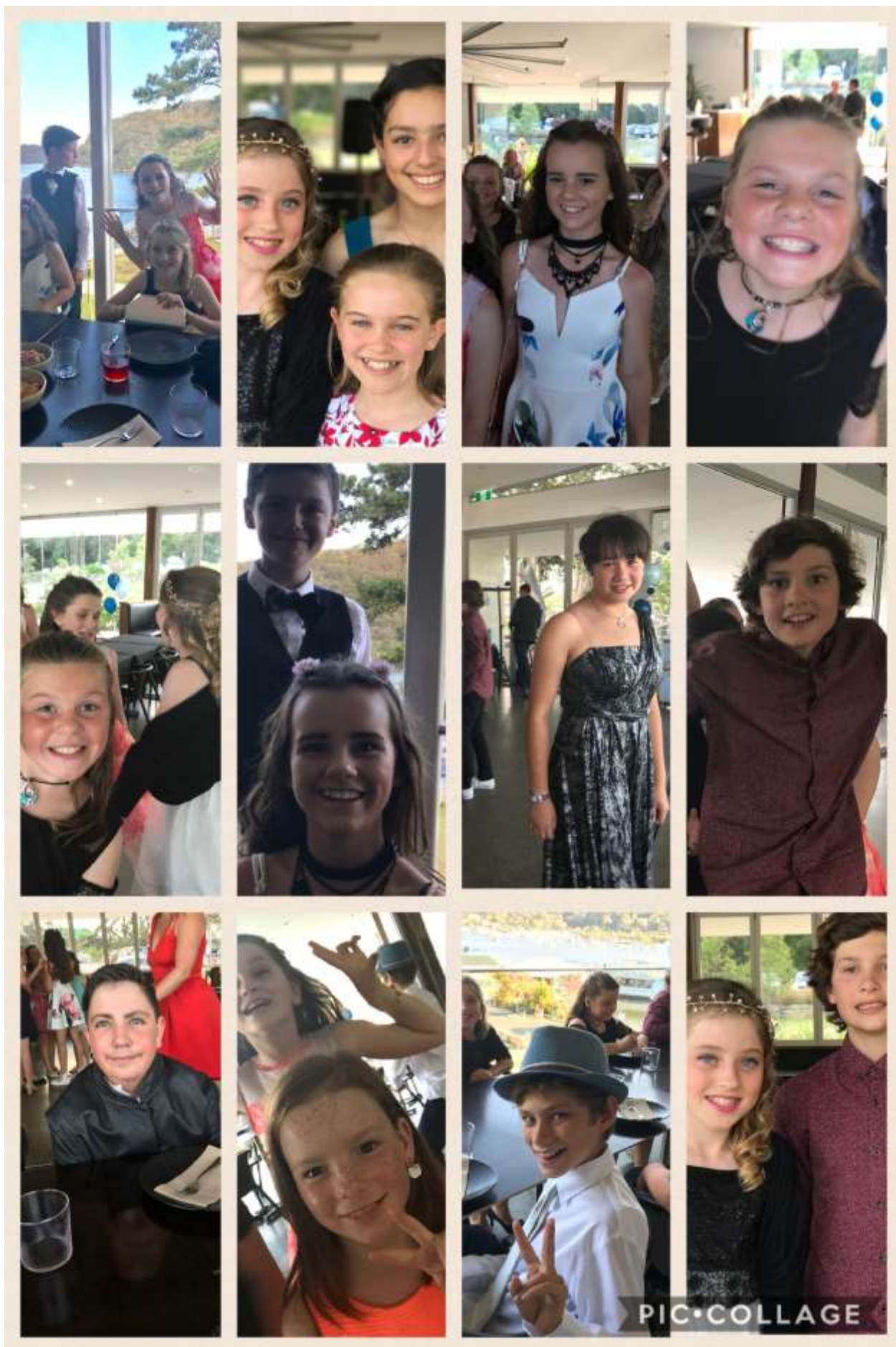
Year 6 Formal