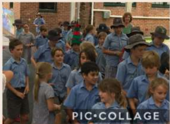
Official opening of Brooklyn Public School COLA