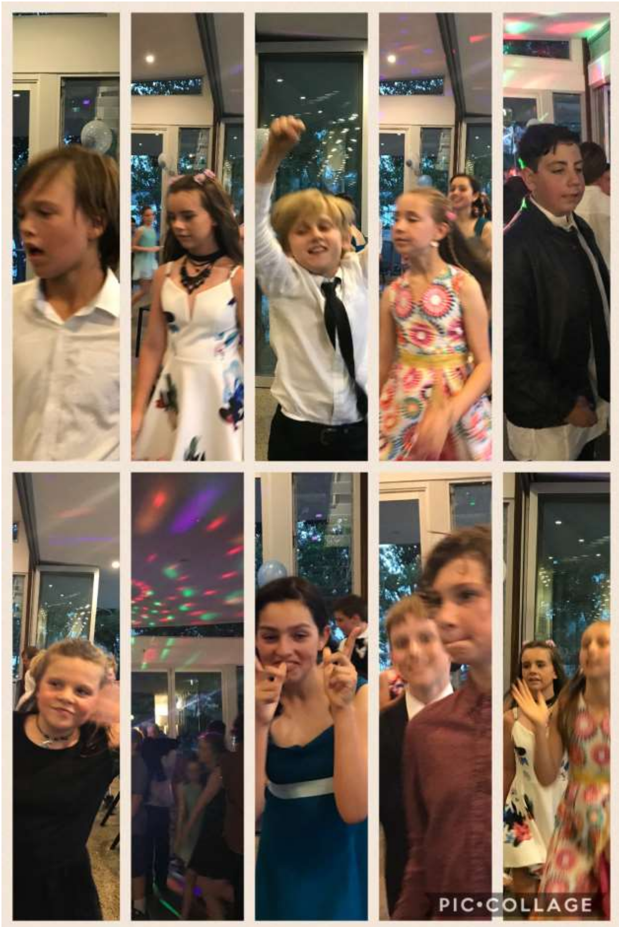
Year 6 Formal