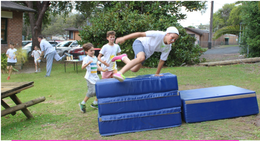
COLOUR FUN RUN DAY.....