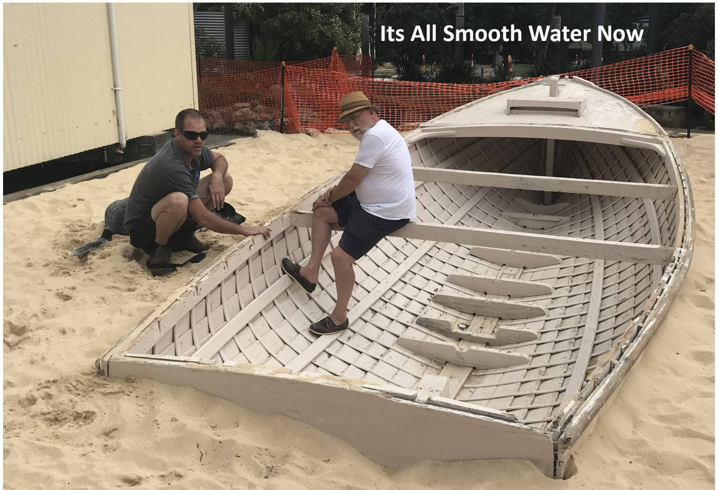
Its All Smooth Water Now

The Senior Girls Oz Tag Team went to Dural Park for the finals. Our team was made up of the senior girls from Cowan and Brooklyn. We played 5 games, we lost two, tied one and won two.