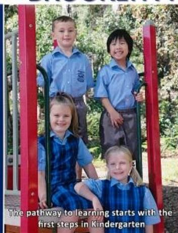
The pathway to learning starts with the first steps in Kindergarten

During the Transition sessions, your child will participate in a range of fun and educational activities similar to the activities that occur in a Kindergarten classroom. While your children are having fun in the Kindergarten classroom there will be information sessions scheduled in the library. These include school attendance and general school routines.