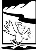
Brooklyn Kids Club