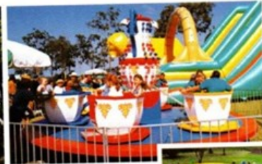
Cup & Saucer

PRE-PURCHASE YOUR RIDE TICKETS BEFORE THE DAY AND SAVE $$$