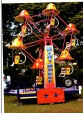
Mini Ferris Wheel